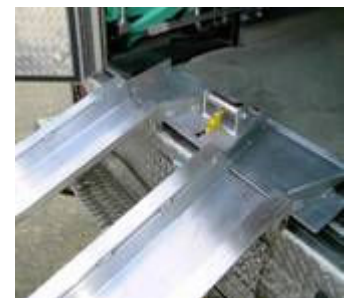
Removable ramp attaches easily to the ambulance