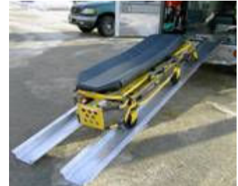
TranSafeSystems cot loading system in operation

Call MEDPRO today - 800-425-9881 Sales · Installation · Service