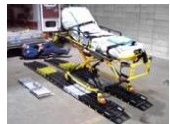
Convenient ready-to-install kits are available